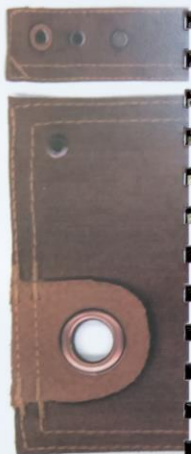
Brass or copper eyelets for a heritage look

Eyelets Faced with leather cut to shape for strength and usability, adapting folds with the volumes of fabric to change shape and, versally, eyelets could hold the folds along with ties going through or a toggle attached somewhere on the garment.